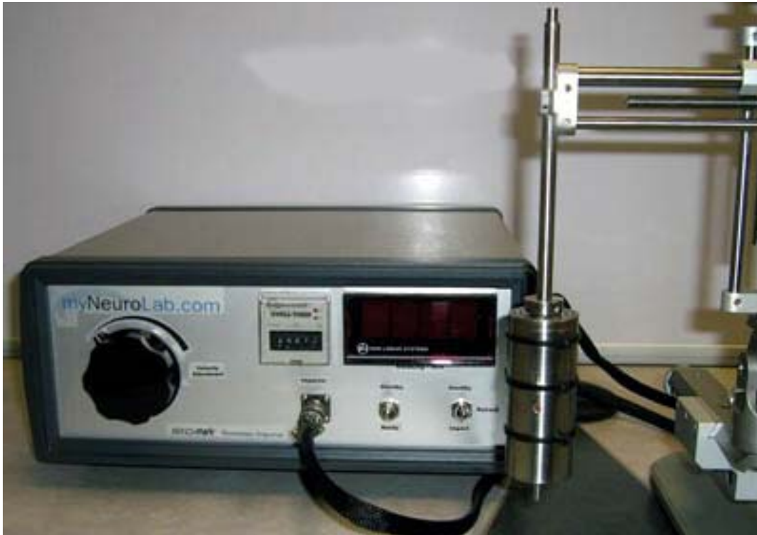
Figure 1. Benchmark Stereotaxic Impactor

Actuator mounted on a stereotaxic manipulator on right, control box on the left side of the picture. Tip at bottom of actuator is the site of impact. The tip can be unscrewed, and a variety of tip sizes and an extender are included.